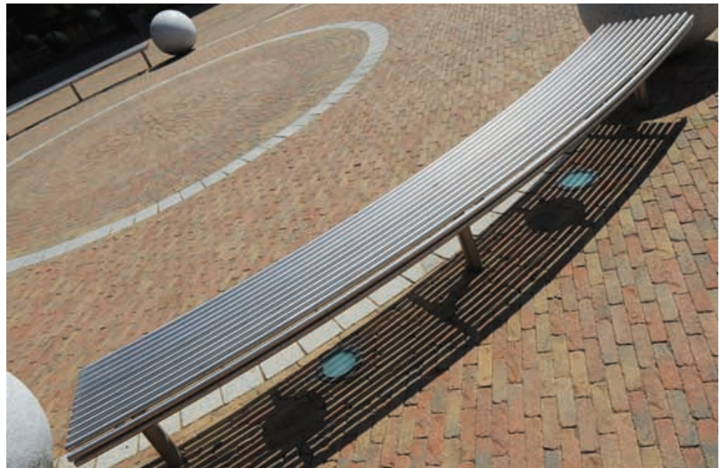
Craigavon Civic & Conference Centre: Retro 60mm Heather, Tegula Circle Heather with bands of Sienna 60mm Silver