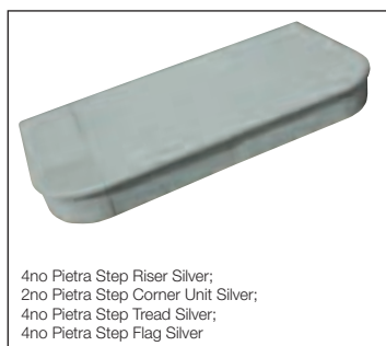
4no Pietra Step Riser Silver; 2no Pietra Step Corner Unit Silver; 4no Pietra Step Tread Silver; 4no Pietra Step Flag Silver