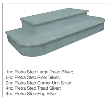
1no Pietra Step Large Tread Silver; 8no Pietra Step Riser Silver; 2no Pietra Step Corner Unit Silver; 4no Pietra Step Tread Silver; 4no Pietra Step Flag Silver