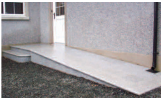
Steps and ramp created with Pietra Granite Step Units