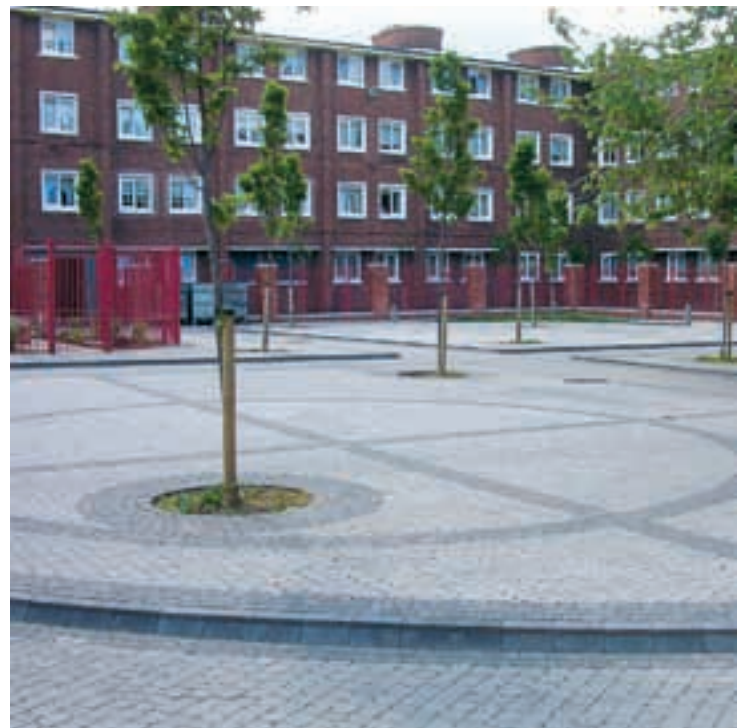
George's Place, Dublin: Mayfair Setts 60mm Silver and Tegula Setts 60mm Charcoal