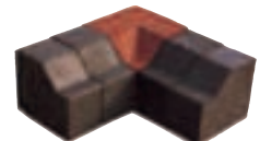
Right Angle Corner Internal Low (Type IC/L)