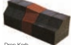
Drop Kerb High Position to Low (Type H-L)