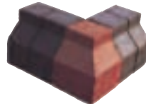
Right Angle Corner External High (Type EC/H)