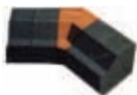
45° Internal Corner Low (Type I45/L) High (Type I45/H)