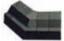
45° External Corner Low (Type E45/L) High (Type E45/H)