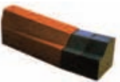
Transition Kerb Low Position to Half Batter (Type L-7) High Position to Half Batter (Type H-7)