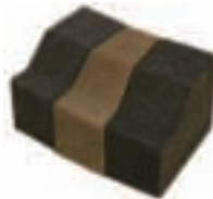
Curves (external radius less than 1m) Low (Type ER/L) High (Type ER/H)