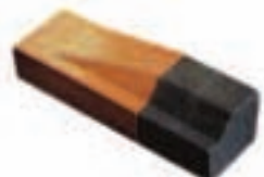
End Block Low position to End Block (Type L-E)