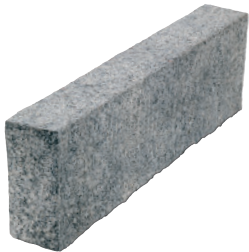
pietra granite kerb

Tobermore have a full range of kerbs, garden edging and water channels suitable for both heavy and light duty applications.