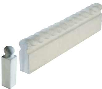
rope top & corner piece

Rope Top Edging is ideally suited for paths and patios. The period character of Rope Edging has its own unique appeal and will enhance any garden path.